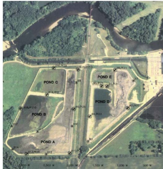
Coal Ash ponds at Eagle Valley.